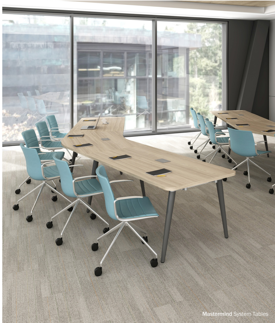
Mastermind System Tables