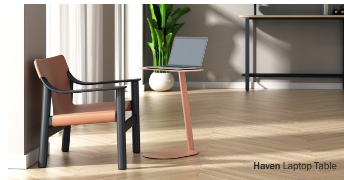
Haven Laptop Table