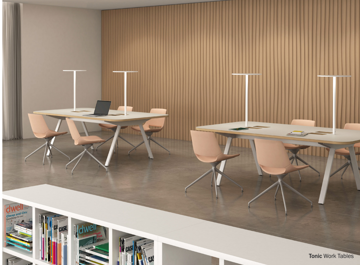
Tonic Work Tables