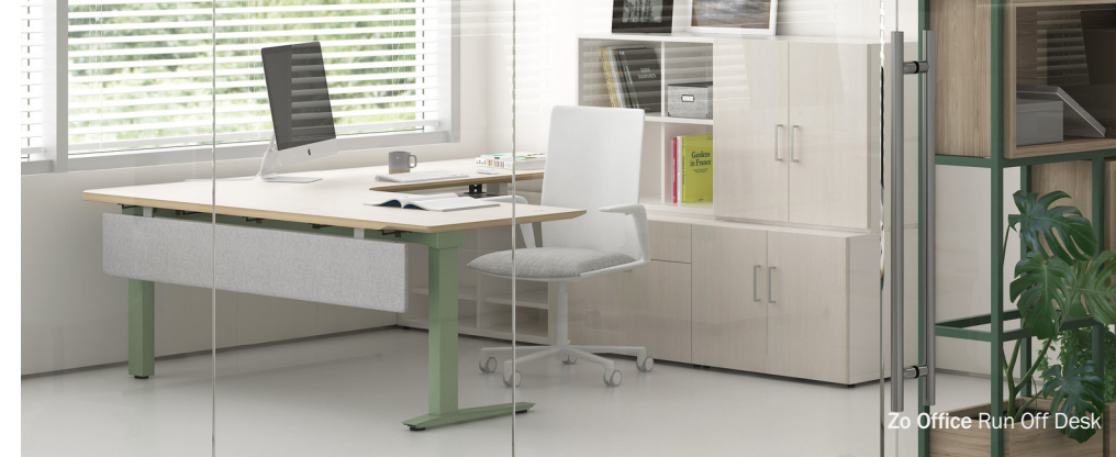
Zo Office Run Off Desk