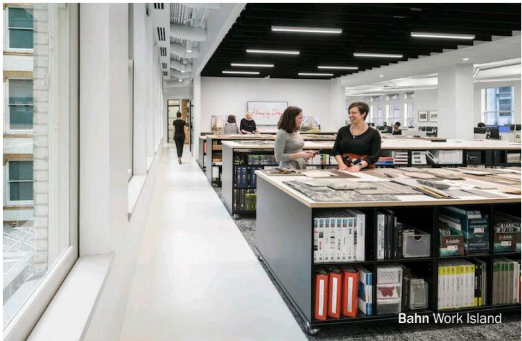
Bahn Work Island