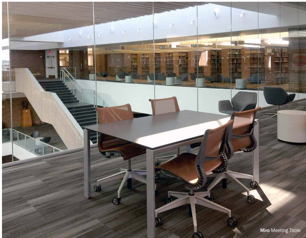
Miro Meeting Table