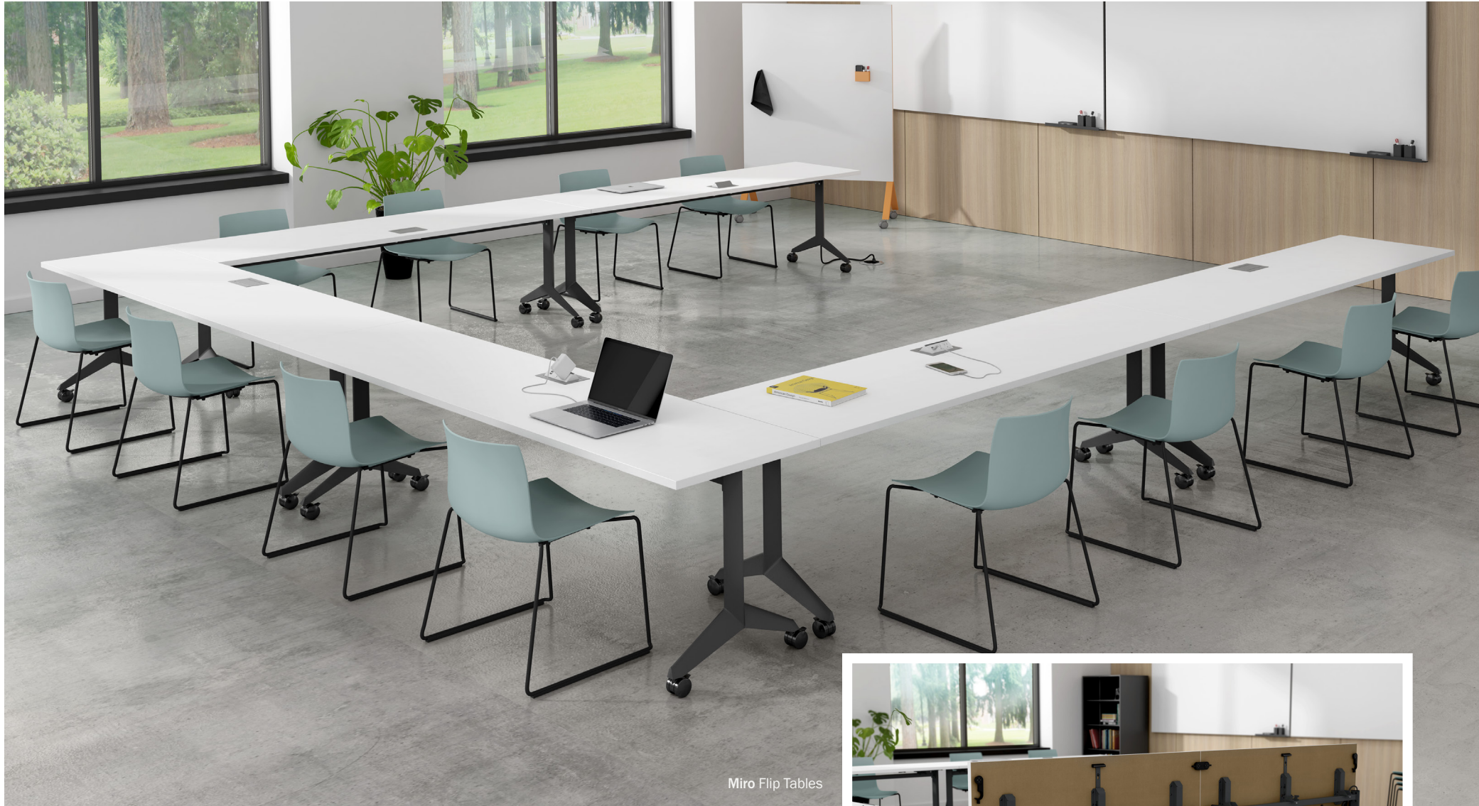
Miro Flip Tables