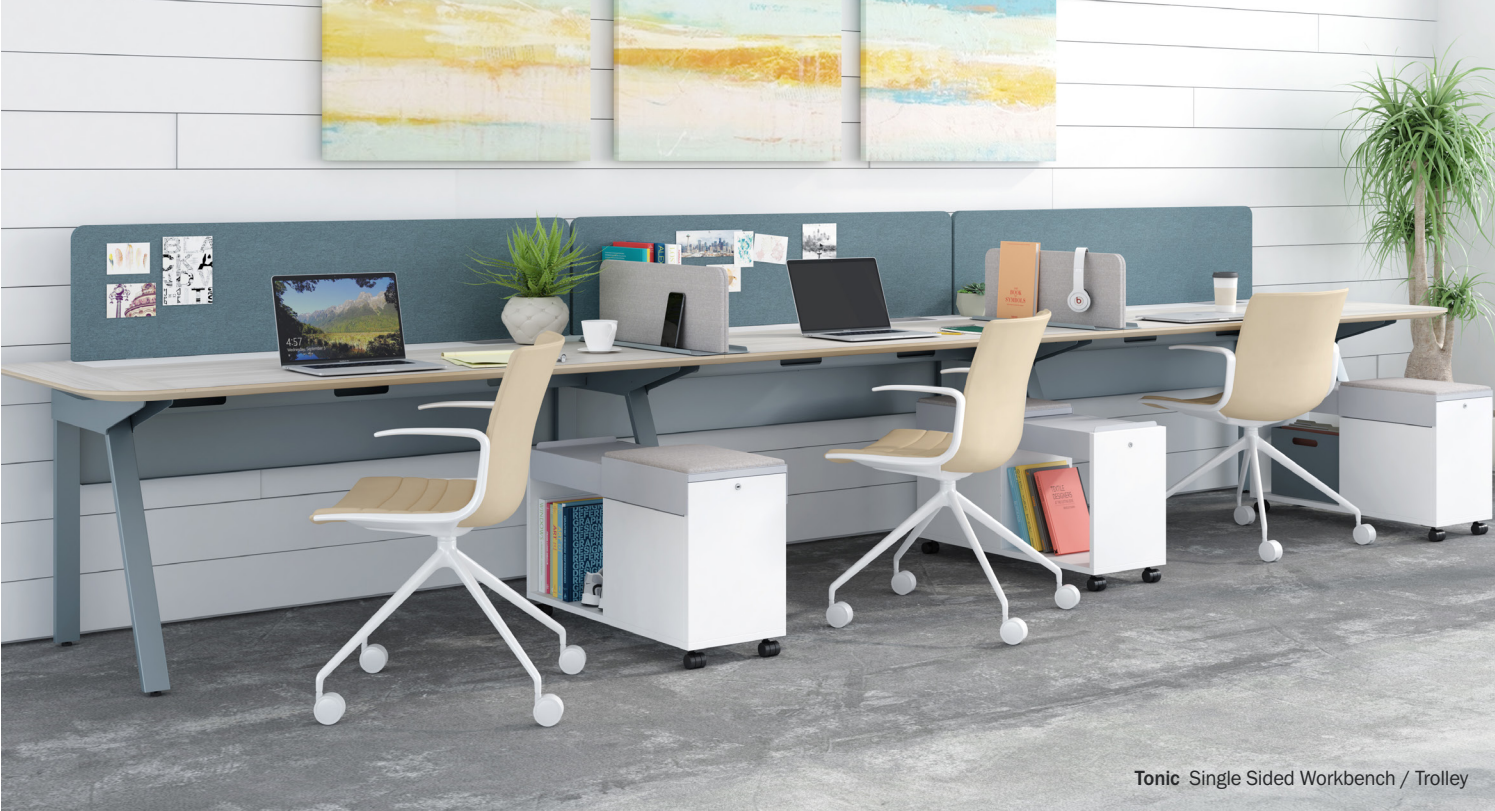
Tonic Single Sided Workbench / Trolley