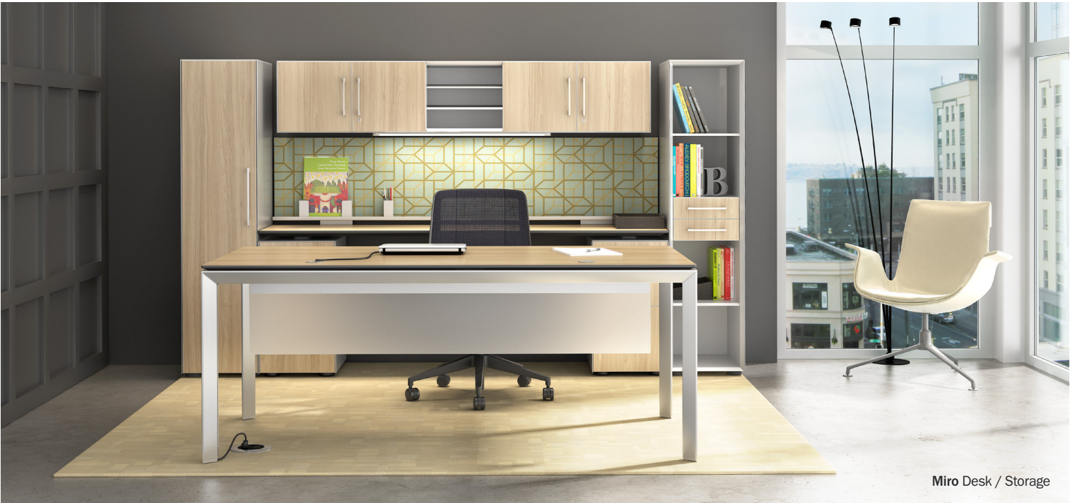
Miro Desk / Storage

Faculty and administrative workspaces need to support multiple work modes, from private offices to reception and shared resource rooms. Maximize your available footprint by utilizing smart worksurfaces and storage.