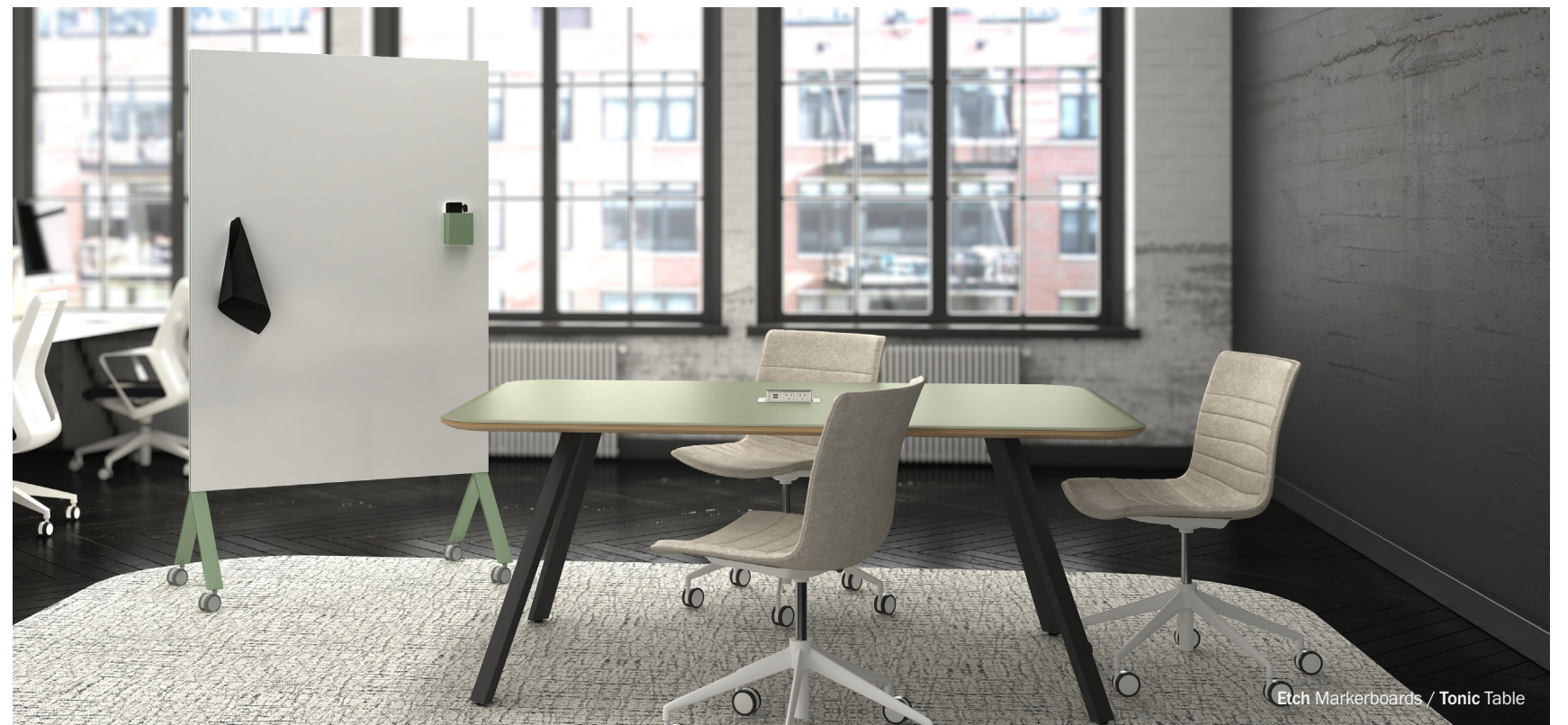
Etch Markerboards / Tonic Table

A staple of the education landscape, libraries support the needs of students and faculty members. A range of Watson products can provide spaces for social learning, discovery, and focused concentration that thoughtfully integrate technology.