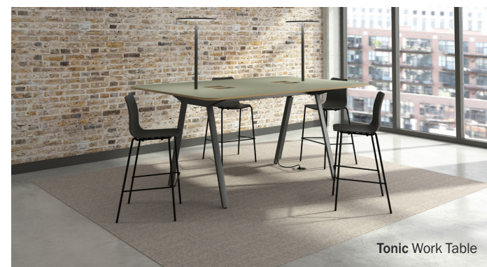
Tonic Work Table