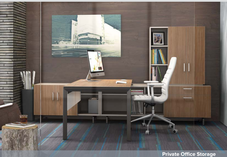
Private Office Storage