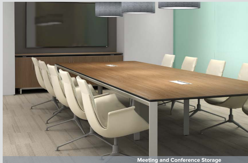
Meeting and Conference Storage