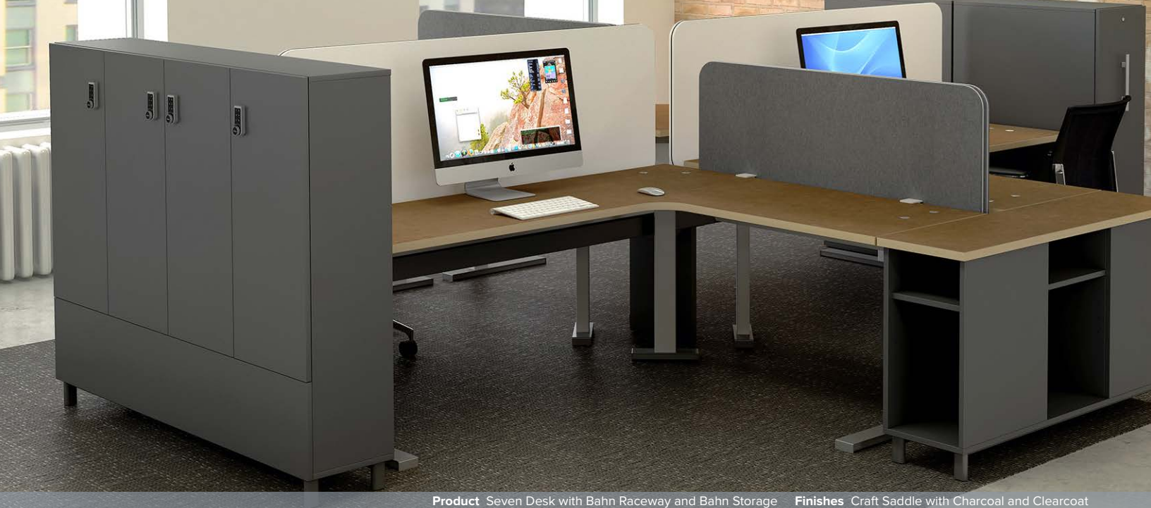
Product Seven Desk with Bahn Raceway and Bahn Storage Finishes Craft Saddle with Charcoal and Clearcoat