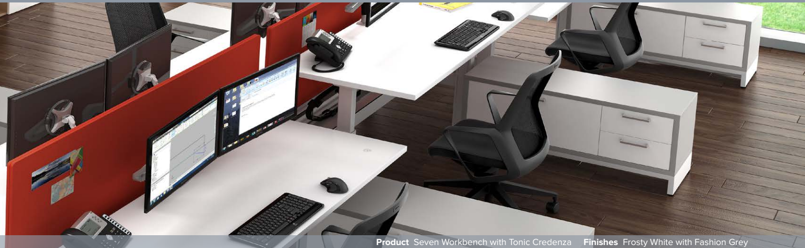
Product Seven Workbench with Tonic Credenza Finishes Frosty White with Fashion Grey

Where more storage or surface area is needed, Tonic Credenzas fit the bill. Tailor your design with optional stacker and base. Add bins, and you're smartly organized.