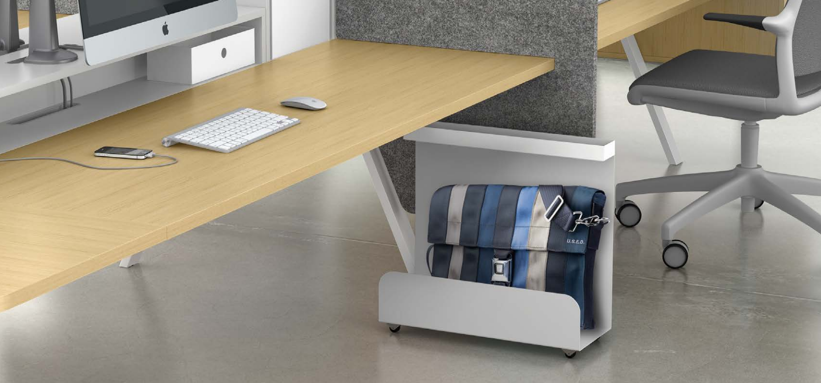
Product Tonic Bench with Stash Finishes Blonde Echo and Fashion Grey with Frosty White