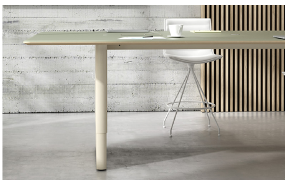
Always room for one more

Inset, thin lifting columns maximize leg room and seating capacity.